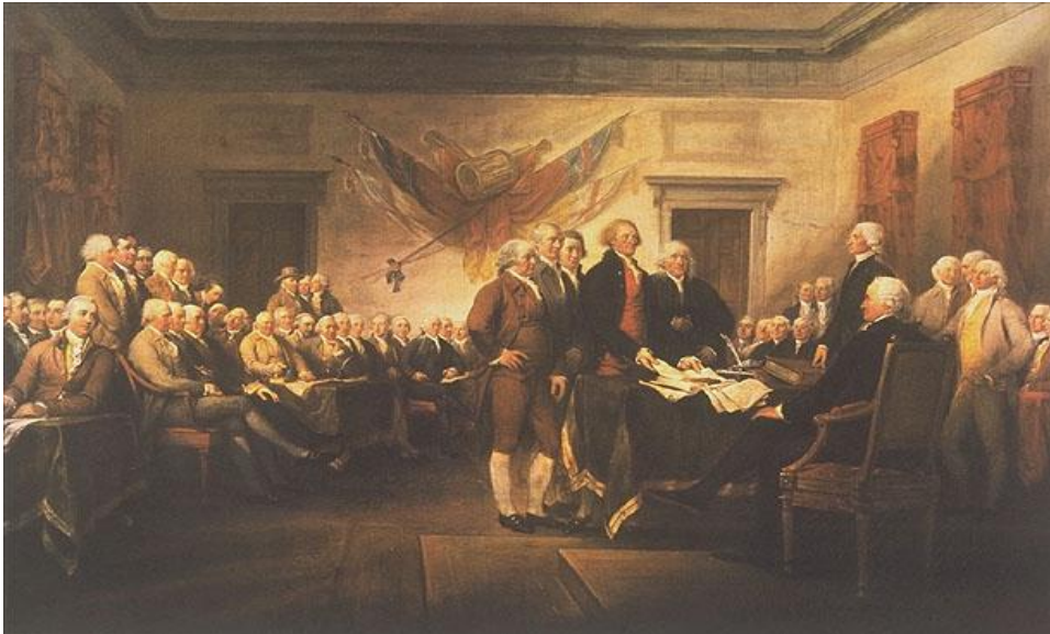
"The Declaration of Independence" by John Trumbull

Many of the portraits were painted directly onto the canvas from life between 1789 and 1794, as Trumbull returned to New York upon the meeting of Congress there in December of 1789 for that purpose. He is said also to have carried the canvas about the country with him to take advantage of any occasion which might arise. Possibly a few were done from pencil portraits.